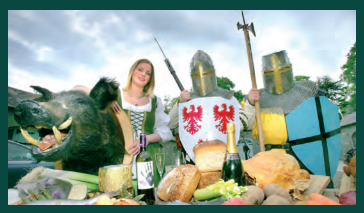
New Fly Fair